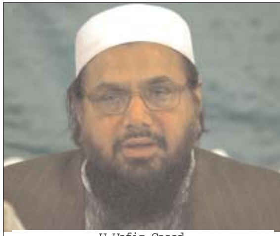
U Hafiz Saeed

U Hafiz Saeed, uba long u heh nongialam jong ka kynhun lehnoh Lashkar-e-Taiba (LeT) ia uba la shah thwet bad kwah kem da ka ri India, u la pynrem jur halor ka jingthombor ia