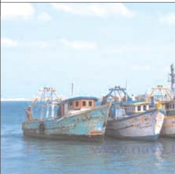
Ki bynta jong ka um ba marjan bad ka jaka ha kaba ki nongtong dohkha ka TN ki la shah kem.