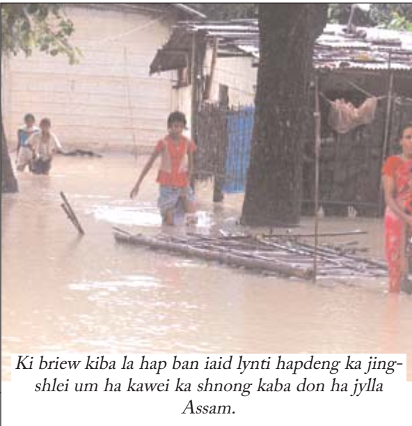
Ki brieve kiba la hap ban iaaid lynti hapdeng ka jingshlei um ha kawei ka shnong kaba don ha jylla Assam.